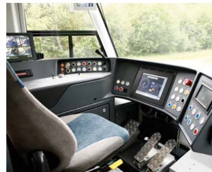
The ergonomic driver's cab provides a good overall view for safe operation.