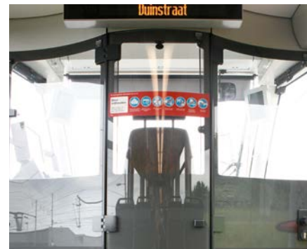
The transparent layout between the driver's cab and passenger area offers passengers a unique riding experience.