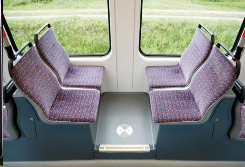
There is seating for up to 16 passengers in each bogie area.