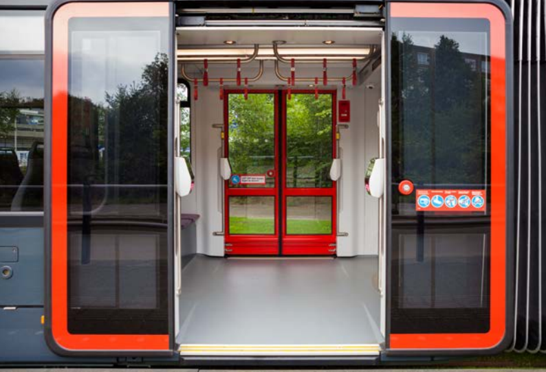
Roomy door areas and evenly arranged double doors.