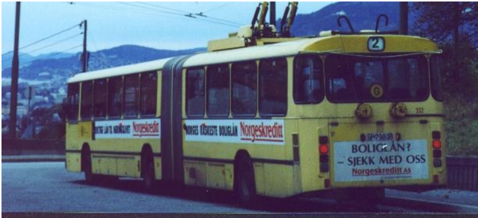
A Mercedes trolley bus in Bergen

Bergen city is situated in a hilly landscape and have many streets along steep hills. Trolleybuses was introduced in 1950 to replace trams and at this time they were, faster and more reliable and silent than trams and buses with initial combustion engine.