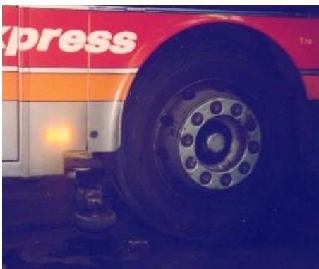
Mechanical track guide systems

Mechanical track guide systems rely on a physical structure on the road to mechanically guide the vehicle. For example small guide wheels mounted on the sides can be used to directly control the steering mechanism through laterally mounted guidance strips.