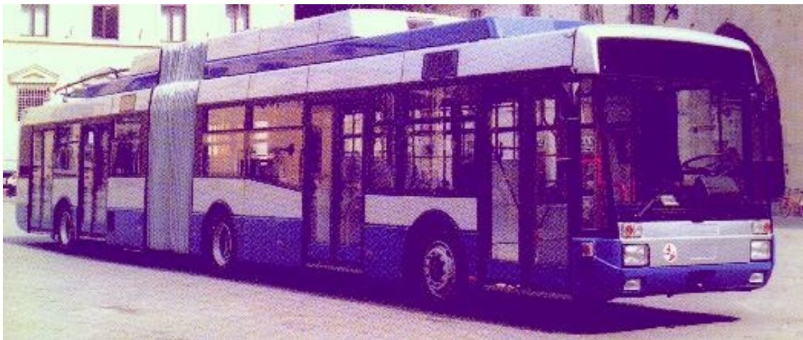
The articulated trolley bus BredaMenaribus F321