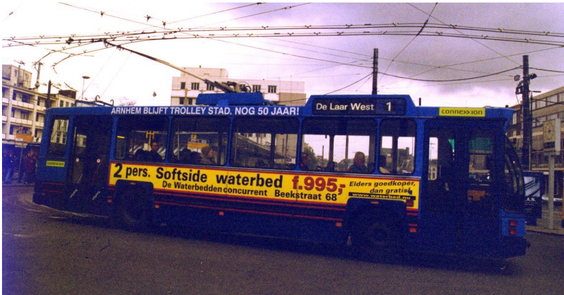
Arnhem will stay trolley bus another 50 years! A trolley bus in Arnhem

The tram system in Arnhem was destroyed in the war. Trolleybuses replaced it and Arnhem is the only city with trolley buses. The route length is 50 km. When other cities in Holland have had a declining market share for public transport, Arnhem have a positive trend. From 1986-92 the trolleybuses increased the number of customers with 13 % and still keep its market share. Today Arnhem has five different trolley bus routes with a total coverage of 50 km. Trolleybuses is the preferred mode of public transport in the city. Minor routes in the city and regional traffic is by dieselbuses. The council have recently decided to invest more money to upgrade the system - Trolley 2000. This investment is a essential part in a grander scheme, the KAN-masterplan, for improving public transport in Arnhem - Nijmegen region. The government will subsidy the trolley net by 4.1 M NLG (2 M Euro)/year. In Holland the environment benefits of trolleybuses is considered to reduce harmful emissions.