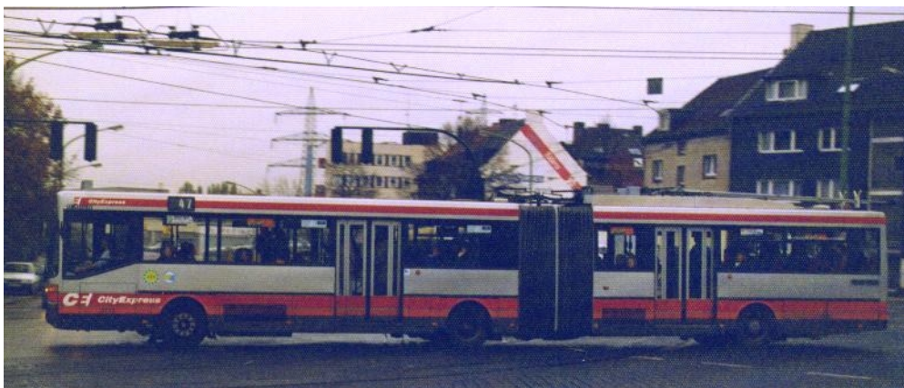
A Mercedes-Benz duo bus in diesel operation in Essen, picture ScanTech Development.

The original selection of the testing and demonstration lines was made in such a way that continuous new lines were created, connecting to existing lines. As many customers as possible were to benefit from the advantages of the demonstration line. In order to ensure that the advantages of joint use of tunnel facilities were noticeable over the entire lines, also these lines outside the tunnel were to include as long route sections as possible in guideways separated from rest of the traffic.