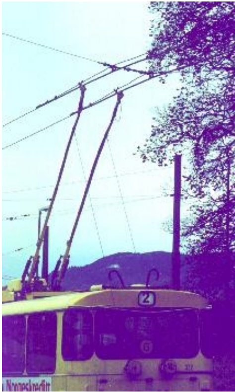
Overhead catenaries in Bergen, picture ScanTech Development.

One of the arguments against trolleybuses is the visual impact of the overhead wiring. However, the development of new materials and suspension techniques has paved the way for lighter and better wiring.