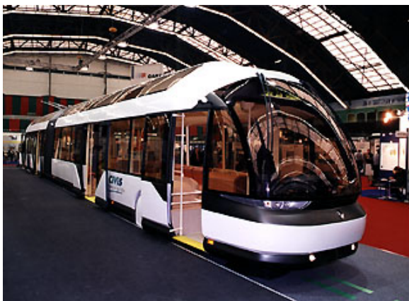
Renault Matra CiViS, picture Renault Matra

Due to wheel hub motors CiViS features a level floor that facilitates boarding and alighting. Since the vehicle shares many of its components with the new generation of Renault buses, maintenance is facilitated.