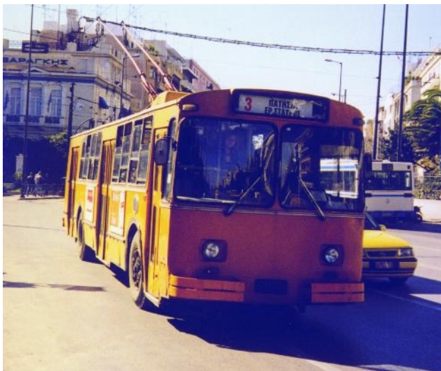
A Russian built ZIU trolley bus in Athens, picture ScanTech Development.

The City of Athens was in the 1980s in the process to be as famous for its smog as for its ancient monuments. The streets passes many steep hills. The geography is thus ideal for trolleybuses. To improve the air quality the government decided to reinvest and greatly expand the trolley bus system. Today it has EUs largest trolley bus fleet. It has 90.000.000 customers a year. In peak hours the trolleybuses operates in five minutes traffic. The routelength is 148 km.