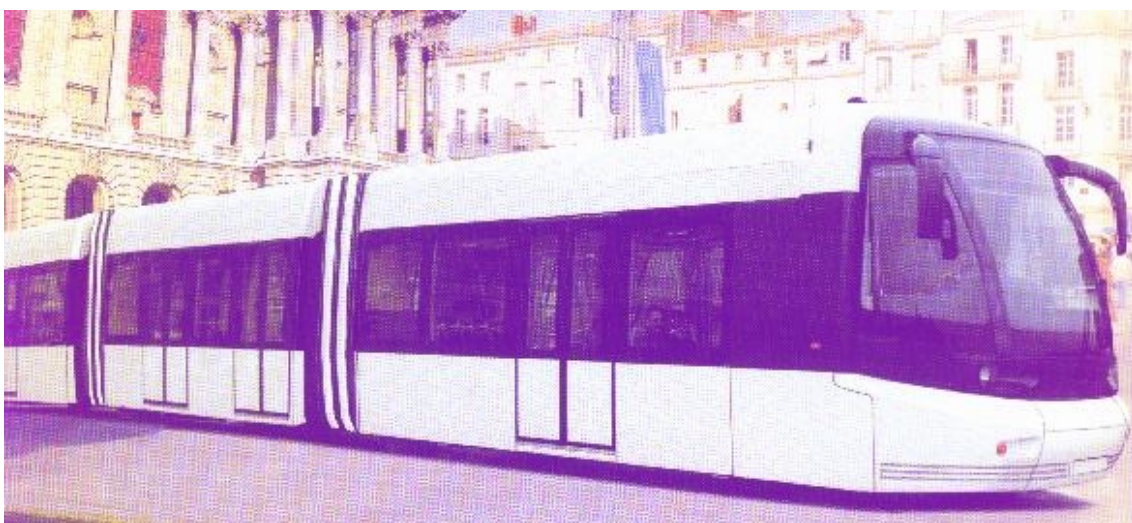
Bomardier GLT/TVR

The French town Nancy has ordered 25 Tram-on-Tyres vehicles that will operate on trolley bus contact lines by the end of 2000. In Caen 24 vehicles using a single contact line and tram pantograph will be in service by 2002.