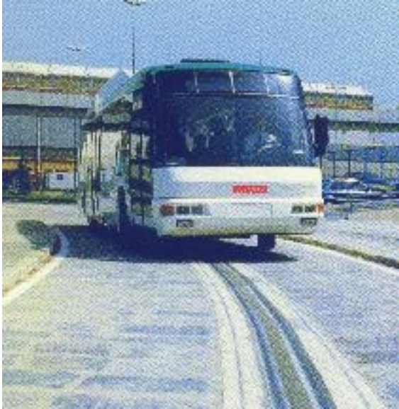
The AnsaldoBreda Stream, picture AnsaldoBreda

Stream does not require segregated lanes and can be driven anywhere the network is installed. It can be driven short distances off the contact line using batteries.