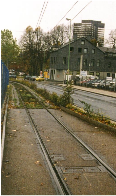
The joint use of track by both trolley bus and tram in Essen, picture ScanTech Development.

It was decided to not interfere with the existing tram catenary system. Because the buses could not fit an pantograph they built a complete separate catenary system of the normal trolleybus type. Therefore the buses was able to run at 750 V and the tram could retain the 600 V system. In the tunnels the trolleybus catenary was kept aside the trams in a low position because of lack of height. Power for the trolley system was supplied from four separate rectifier substations.