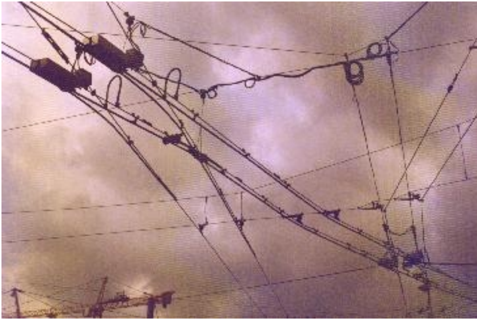
A modern switchgear for trolley buses in an Arnhem bus station