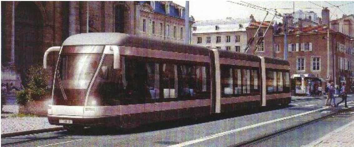
Bombardier Tram-on-Tyres for Nancy, picture Bombardier.

The difference between the GLT and the Tram-on-Tyres is that the GLT when guided by a central rail can be fed by a single wire catenary. The GLT also have a higher capacity, it can take 200 passengers compared with maximum 143 for the Tram-on-Tyres.