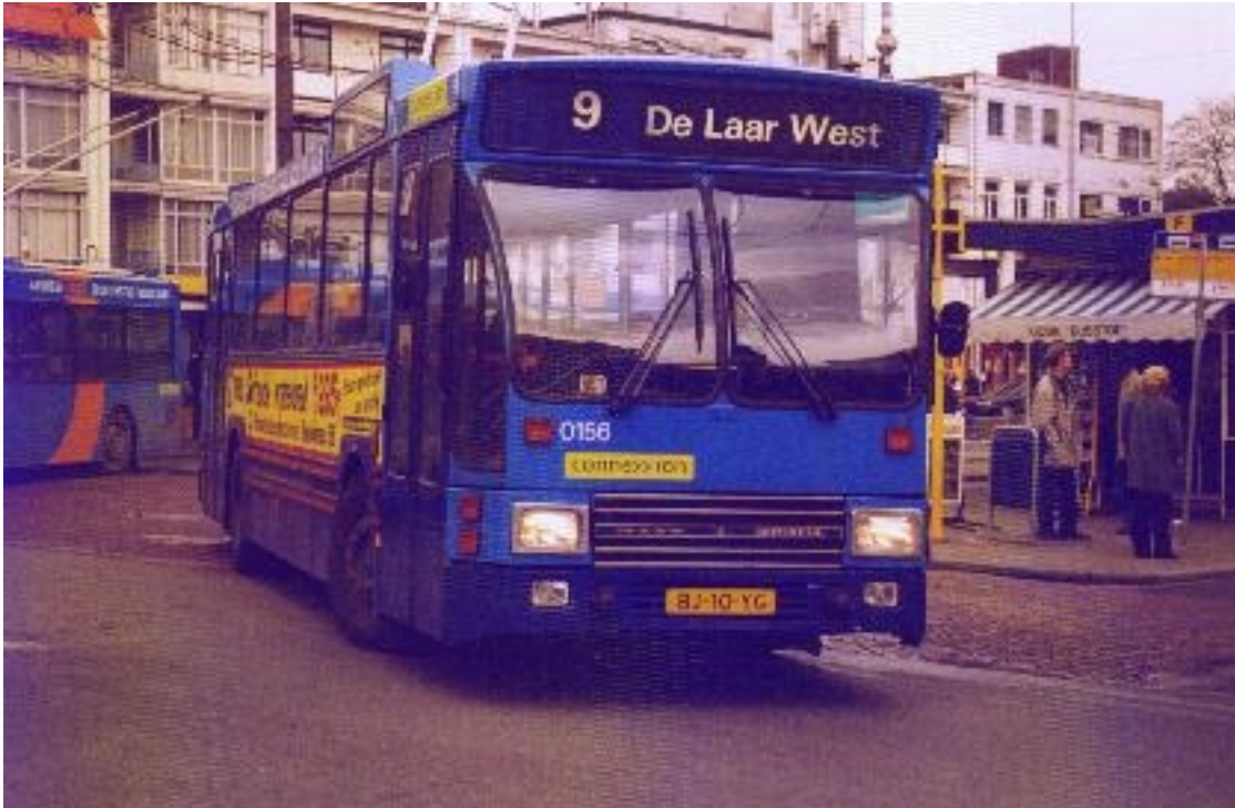
This trolley bus in Arnhem will be replaced by an articulated trolley bus with a capacity of 135 customers

Much effort have been taken in preparing buslines separate from other traffic and to arrange signal systems to give trolleys priority in intersections. Each bus have three large doors to ease access for passengers. By increasing average speed and capacity of each bus, they will cope with increasing customer volume. In peak hours there will pass 8 buses an hour on each route and in off peak hours 4 buses an hour. The revenues of each bus will be higher than in the old system.