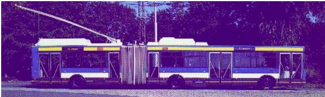
The new Škoda articulated trolley bus 22 Tr, Picture Škoda